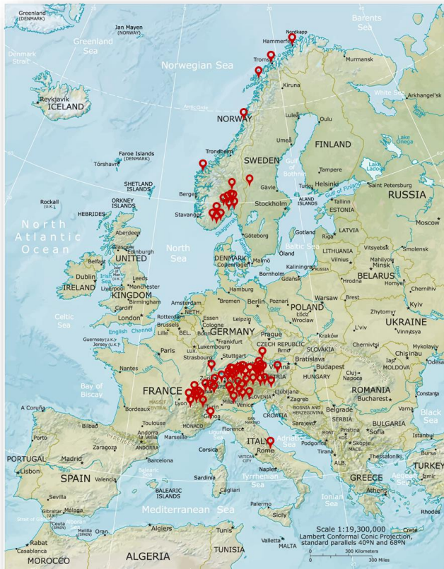
European WADO SNOWBLOWERS dealer network (as of April 2025)

The snowblowers that WADO has been contracted to produce by major brands have long been used in North America and Europe under their brand. Meanwhile, WADO has started exporting directly to Europe under WADO brand since 2018, and WADO SNOWBLOWERS are now loved by users in 7 countries in the Alps and Scandinavia.